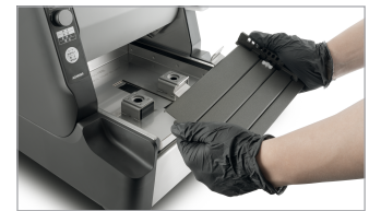
Interchangeable Wrapping Units