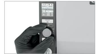
Jog Dial and LCD Screen